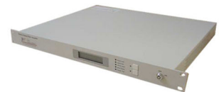
TIP EDFA Optical Amplifier with LCD Display