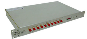
TIP Optical Amplifier Protection Switch with FC connectors