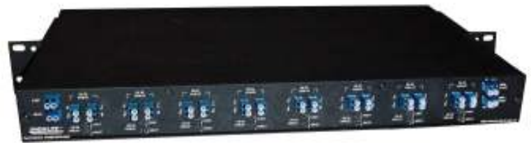
An 8 channel CWDM M-ROADM with VOA ports